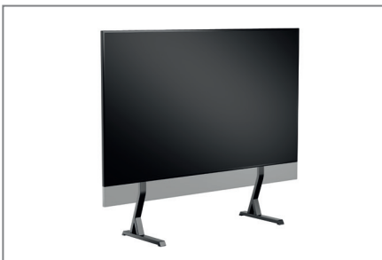
Can be mounted in 3 different heights